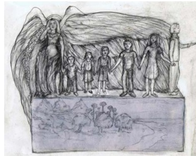
California Peace Angel Monument Artist Rendering – Front View

“... whose vision is to transform the weapons of conflict and violence into ‘Peace Angels’ made of melted weapons.”